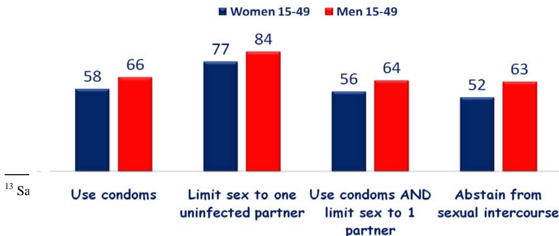
Figure 1: Knowledge of HIV Prevention Methods (in %)

According to Samoa Demographic and Health Survey 2009 preliminary results, “the knowledge of AIDS is high in Samoa. More than 8 in 10 women and almost 9 in 10 men have heard of AIDS” 13 . Knowledge on HIV Prevention Methods is also fairly high – refer Figure 1 below