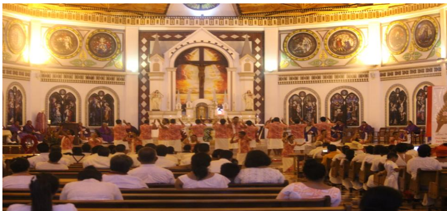
WAD 2015 mass at Mulivai Cathedral