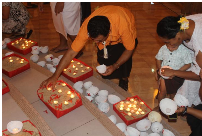
Participants lighting candles for those who have died from AIDS at the WAD mass