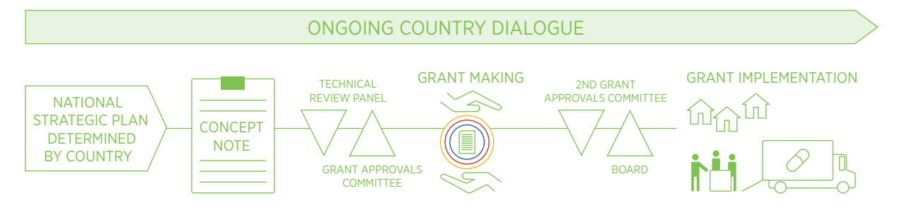
Figure 1 The funding process at the Global Fund.

The graphic below illustrates the process for accessing Global Fund funds.