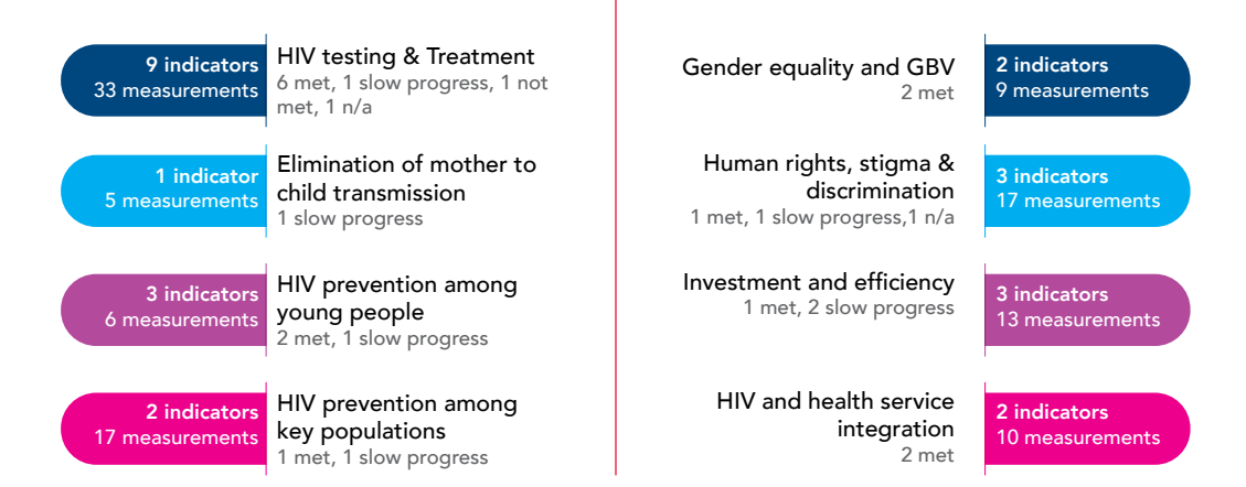
FIGURE 2. PROGRESS ON THE 13 SECRETARIAT FUNCTION INDICATORS