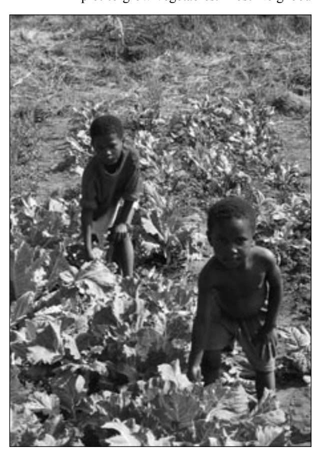
Children have been given their own plots to grow vegetables

Volunteer Care Workers from Mambaftweni also travelled to the Hhohho region to see the work there for themselves. They were particularly impressed by the kitchen gardens they saw, providing vegetables for the Neighbourhood Care Points, and decided they wanted to establish gardens in Mambatfweni too. The Moya Centre (a local nongovernmental organization) using funds from Swaziland Post and Telecommunications Corporation helped them fence the gardens to keep goats and chickens from eating the crops; each child was given their own plot to grow vegetables. Most Neighbourhood Care Points in Mambatfweni have now estab-