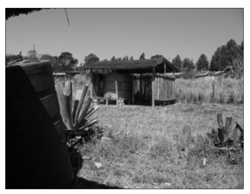
NERCHA has provided silos for communities to store food from Indlunkhulu fields

The reinvigoration of Indlunkhulu fields programme started in 2002, and NERCHA facilitated a process of consultation with traditional leaders and the Ministry of Agriculture and helped to mobilize the communities. In the first year NERCHA and the Ministry of Agriculture and Cooperatives anticipated working with 100 chiefdoms, but the response from the communities was so positive, almost twice as many wanted to participate. Now about 350 chiefdoms are working under the programme, 320 of them in rural areas and the rest, working through AMICAALL<sup>20</sup>, in urban areas. NERCHA also provided