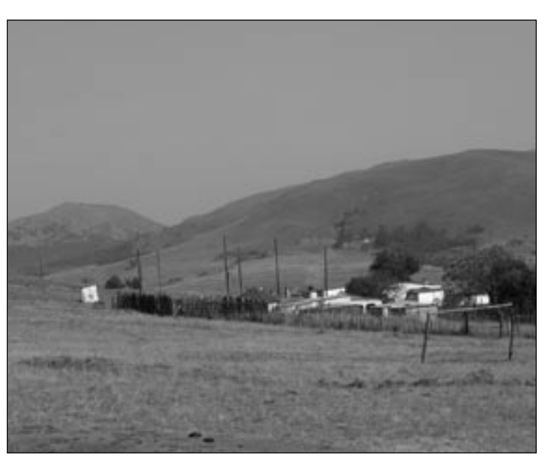
View of Mambatfweni

Mambatfweni is a large community, in the heart of maize growing country, about an hour and a half's drive south west of the Mbabane-Manzini corridor. The road follows the Ngwempisi River, which is almost dry in places now and the landscape is one of rolling hills