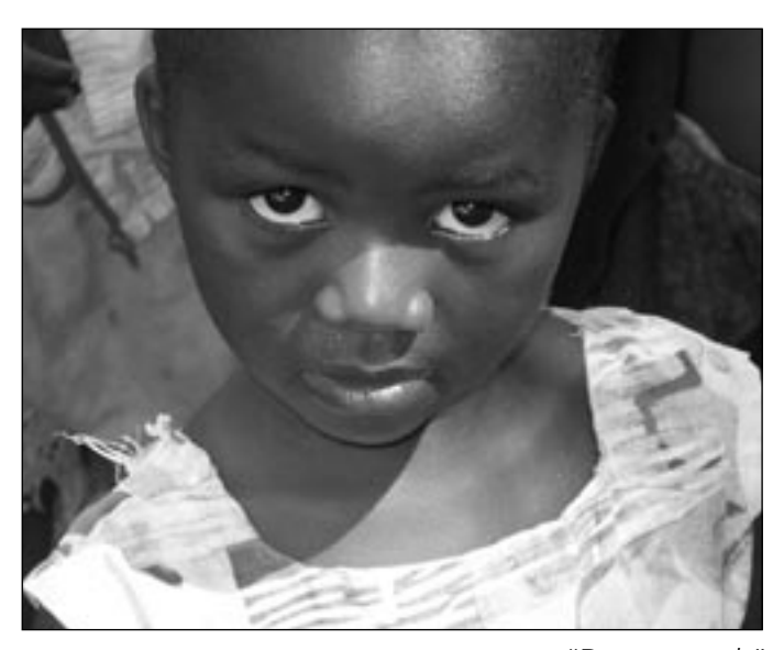
"Do not touch"

NERCHA is working in partnership with, the Swaziland Action Group Against Abuse (SWAGAA) to support