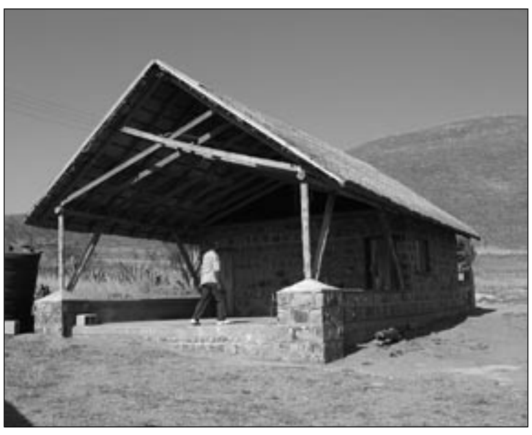
The new KaGogo centre at Mambatfweni

Traditionally the role of the Chief has been as caretaker to the people, looking after their welfare, but in recent times many of these duties and customs had largely died out. Now the traditional practices are being revived to strengthen the community's ability to cope with the impact of AIDS epidemic. The KaGogo centres and Indlunkhulu fields are therefore new initiatives based on traditional ways.