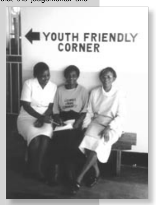
Bauleni Clinic's Youth-Friendly Corner.

The one at Lusaka's Bauleni Clinic is considered a model. Set up in what used to be a kitchen at the back of the main clinic, the room is a drop-in centre for young people. Here, they can speak to other young people trained as peer educators and counsellors, who run the centre under the supervision of the