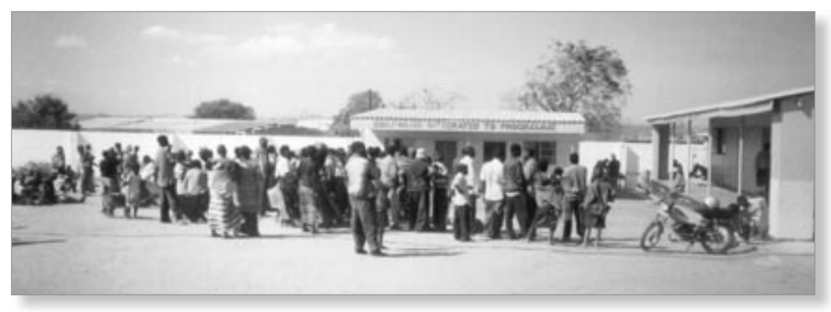
Bwafwano's TB programmes provide a much-needed service in the community.

overburdened by the extra mouths to feed, she explains. If appropriate, the counsellor speaks to everyone together. With the variety of resources and skills it has gathered, Bwafwano now offers HIV/AIDS-affected families a 'triple package' that consists of care for the sick adults, peer support for teenage children of the household offered by the organization's youth group, and care for the small children.