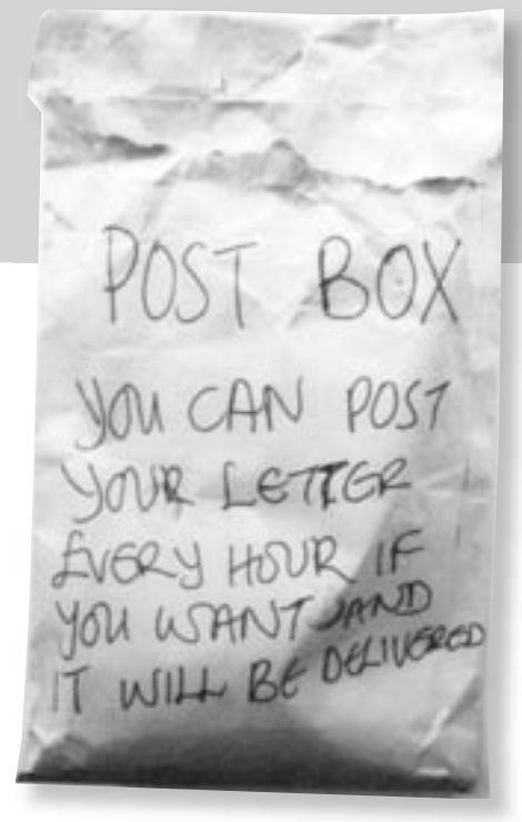
Participants at the HIV/AIDS workshop in Serenje could send each other anonymous messages of encouragement.

Back in Lusaka, Olive Ng'andu acknowledges the risk of a credibility gap, but says that making people feel intimately involved in the workshop process is the key to avoiding it. By getting nurses and midwives to identify the issues that are important to them, and to search for their own solutions to their problems, the participatory learning approach is very effective, she says.