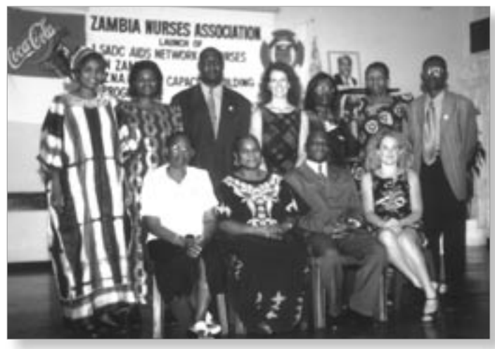
SANNAM/Baylor Training of Trainers Workshop with the Zambia Nurses Association, 3-6 September 2002.

In addition, a needs assessment survey has been carried out in each of the member states. This will form the basis of future action by SANNAM to enable nurses and midwives in the region to respond more effectively to the HIV/AIDS epidemic (see Annexes 1 and 2).