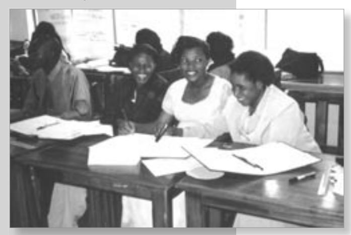
The HIV/AIDS workshop in Serenje, Zambia.

But facing such challenges on a daily basis also leads to burnout, comments Jennifer—especially as the poor conditions in hospitals and the struggle to keep up standards of care have impacted directly on the image of nursing and midwifery. Whereas the profession once enjoyed high status and respect in Zambia, "today, many people see nursing as a dirty job for nothing," she says.