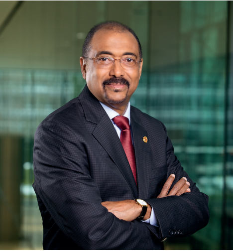
Michel Sidibé Executive Director of UNAIDS

Ladies and gentlemen; dear friends; Members of the Programme Coordinating Board.