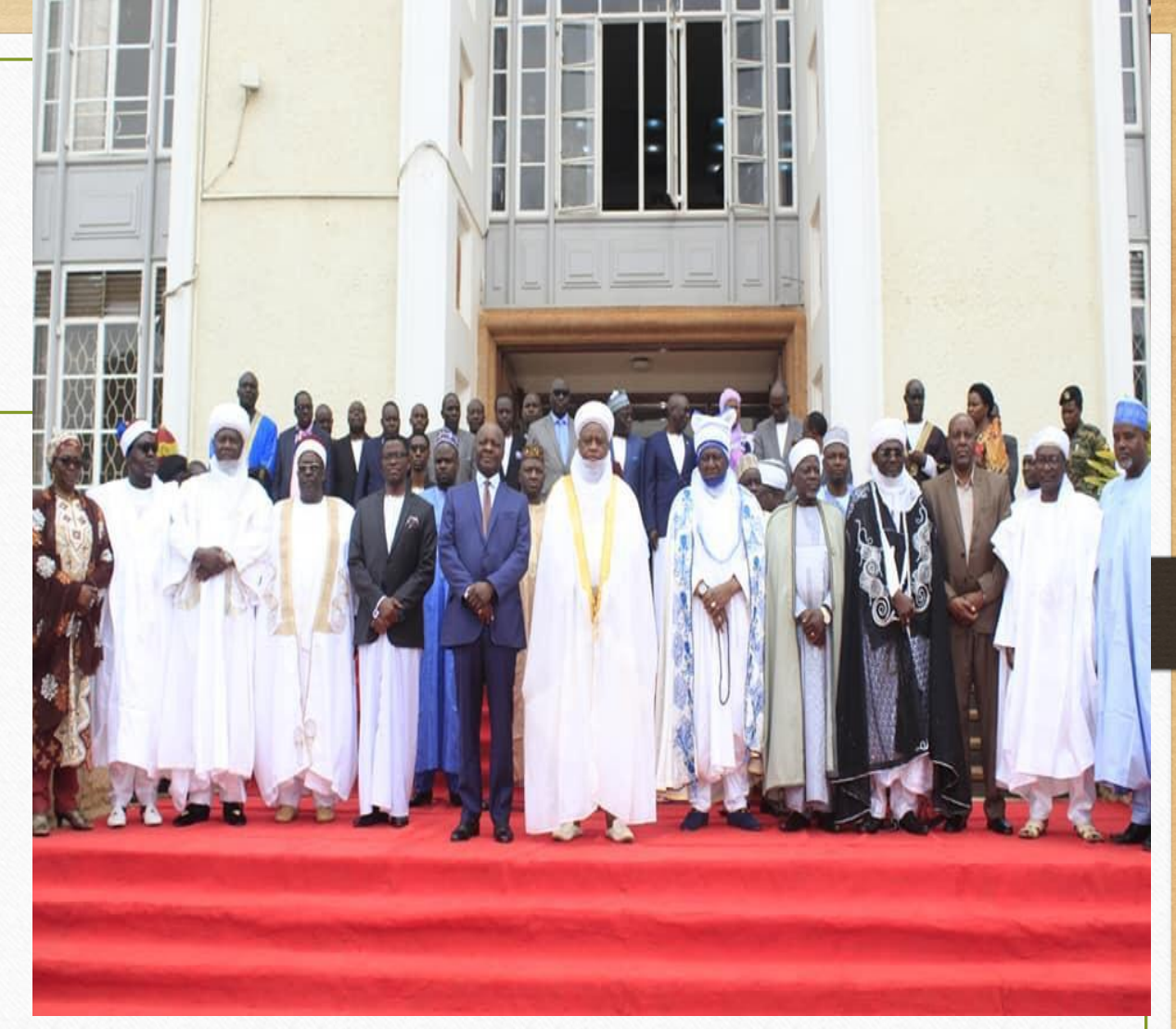
Other African Cultural leaders have often visted the Kabaka discussions have been on the HIV theme and other health issues