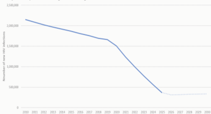
Projected Impact of Reaching the 2025 Targets on new HIV infections

Reaching the 2025 targets will reduce AIDS-related deaths to under 250 000 in 2025