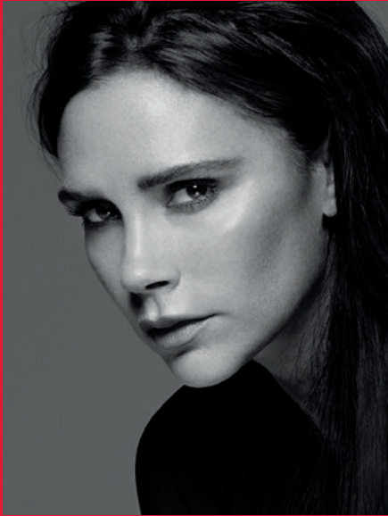
Victoria Beckham, UNAIDS International Goodwill Ambassador

“This is the beginning of an important journey for me. I am proud and honoured to be taking on this new role as International Goodwill Ambassador for UNAIDS, helping to raise resources and awareness around HIV. As a woman and a mother I have a responsibility to support other women. I strongly believe that if we work together all women can be empowered to keep themselves and their children free from HIV.”