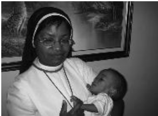
Infant in Care Nazareth House

Finally, the Faith in Action Report posed some important questions and challenges, such as the following.