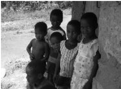
Children at Hlabisa

Staff and volunteers in these programmes recognise the necessity of forming an active partnership with the children whose lives are so deeply affected by HIV. They refuse to treat the children as passive objects of bureaucratic mechanisms or