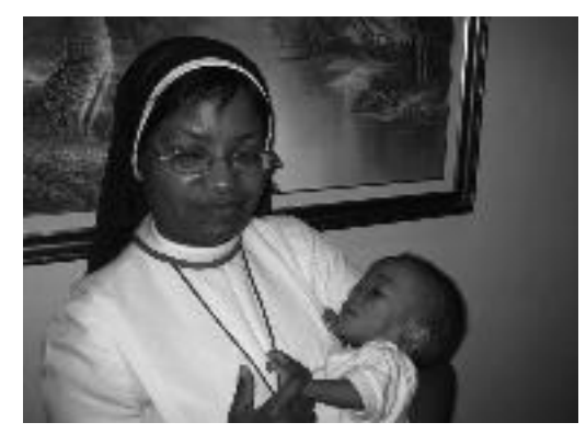
Infant in Care Nazareth House

Finally, the Faith in Action Report posed some important questions and challenges, such as the following.