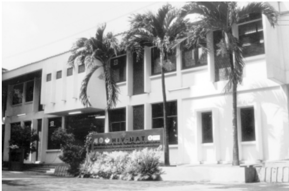
New HIV-NAT office on Rajdumri Road