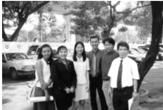
Wednesday Friends Club and friends

HIV-NAT has been fortunate in that the largest organized group of people living with HIV (PWH) in Thailand, the Wednesday Friends' Club, is part of the Thai Red Cross AIDS Research Centre of which HIV-NAT is also a branch. This means that lines of communication with the population most affected by HIV are short and that criticism and suggestions of our PWH colleagues can easily be incorporated into HIV-NAT's operations and future projects. At the same time, the Wednesday Friends' Club members work as peer educators who make HIV-NAT's research and its purposes widely known among PWH. (A selection of Case Interviews with PWHs can be found at Appendix C.)