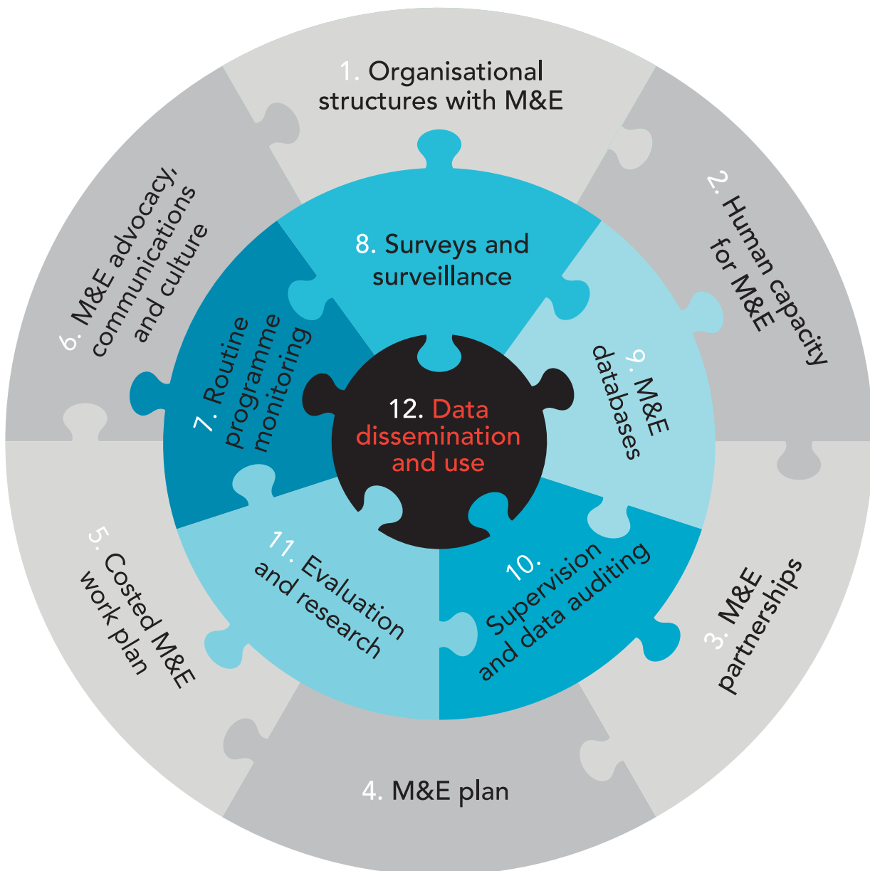
Figure 2. Organizing Framework for a Functional National HIV M&E System – 12 Components